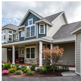
Great American Spaces™