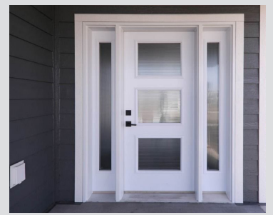
8. READY FOR INSTALLATION