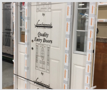
7. THE CUSTOMIZED DOOR IS PACKAGED AND SHIPPED