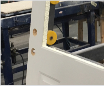
3. HOLES ARE BORED FOR HANDLES AND LOCKS