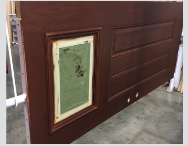
5. THE DOOR GETS PAINTED OR STAINED