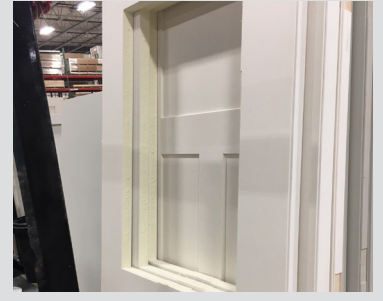
2. HOLES ARE CUT FOR LITES