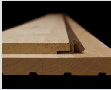
4. JAMB IS SELECTED