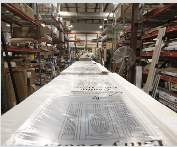
6. ALL OF THE COMPONENTS ARE PUT TOGETHER