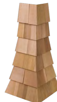
6x6 column wrap with flared base