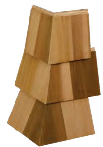
3-piece flare corner set

When a project requires a custom design, Cedar Valley has the expertise to create it. Whether you need column wraps, radius flare-outs or extended return corners, Cedar Valley can bring your designs to life. Call today to discuss your custom design.