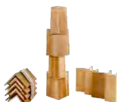
Matching Flush 90° Corner Bundle

You don't cut corners on your home; we don't either. Our mills source only the highest grades of Western Red Cedar, all sustainably grown and harvested in the Pacific Northwest. Did you know you can install Cedar Valley products yourself using basic tools? This saves you time and money so you can get right back to enjoying your life.