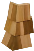
3-Piece Flare Corner Set

Your family deserves a house that's distinctive, creative, and timeless. Customized design with quality cedar enhancements can set your home apart for years to come.