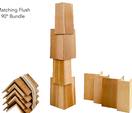
Matching Flush 90° Bundle

Leave no detail uncovered with a full line of standard accessories to complete most shingle style designs. Flush mounted corners in 90 and 135 degrees, decorator accents, and radius wall panels handle most siding needs. All accessories are handcrafted with the same attention to detail and will perfectly match the panel in style, exposure, thickness and texture.