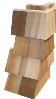
4-piece radius window flare with extended return legs