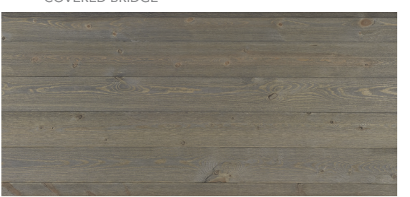
OLD BARN GRAY