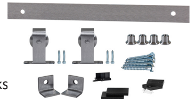
407 Brushed Nickel