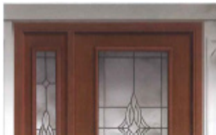
Dura-Tech™ Wood Grain Stain